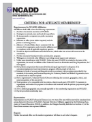
Criteria for Affiliate Membership